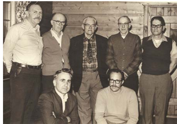
Former QHR&G Club presidents (Photo about 1972)

I often reflect on sporting days past when I spent much of my time at the Quaker Hill Rod and Gun Club, Oxoboxo Dam Rd. in Montville. I was a member of that club from 1955 – 1985. I graduated high school in 1956, and many of my college days were spent at home on weekends, which enabled me to shoot skeet and use the 200-yard rifle range. At that time I was a dedicated skeet shooter and a precision small-bore rifle fanatic. Both were passions in those days along with bird-hunting. Woodchucks in the immediate area were never safe in my presence! Gradually, skeet inclined to boredom, and spacious shooting fields became the exception, as several were placed "off limits" because of housing encroachment and/or noise complaints. Back in the 1970's, someone suggested a photo-op session at one of our monthly board meetings because all of the most recent presidents were in attendance. The memories came flooding back when I rediscovered the following picture in the archives of memorabilia: