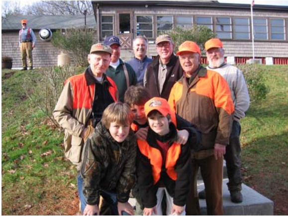
The young and old(er) at Snake Meadow Club (11/25/06)